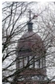
Dome: Learning apart for working together in the world.