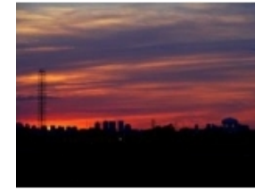
Dusk: Kennedy rail overpass

All Saints Romanian Orthodox Church, Danforth Road in Scarborough in foreground stands out with a heart for those who experience poverty. It is connected to St. John The Compassionate on Broadview Avenue, where meals are lovingly prepared for those who are hungry. 🔗