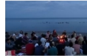
Satsang: A gathering of truth seekers on a beach.

On an expansive tract of land sits St. Augustine's Seminary in Scarborough semi-isolated from the surrounding community, and yet adjacent to a church and a high school. Is a learning environment where students can learn in silence with an attitude of submission ideal for reconnecting to our communities? 🔗