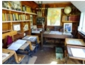
Schoolhouse: We've come this far by faith

One morning a task and a nearby photo location came together in location and time. This is where I captured the dawn back lighting and under lighting of the Finch Corridor pylons on Beare Road in rural northeast Toronto. In the distance, I could see deer silhouettes just beyond the reach of the camera, and hear wild turkeys hiding in a forested area across the road in a call and response to calls from gulls, song sparrows and crows. 🔗