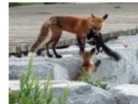
Breakfast: Under the boardwalk at Woodbine Beach

Sunset, Communications Tower and water tower in cityscape Toronto as seen from Scarborough. Places to live, places to sleep, physical needs to be met, and community. 🔗