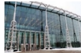
Preservation: Safekeeping our stories, ideas, and knowledge

Track switches and sidings seen from the rail overpass on Kennedy Road and a very tall communications tower. 🔗