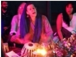
Miranda: A culture- bridging heartbeat

A squirrel makes supreme sacrifice to aid the greater flow of nature. Baby fox can eat. 🔗